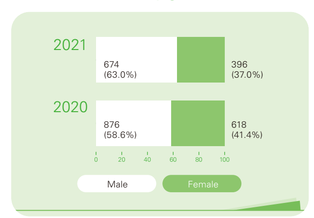
Staff by gender