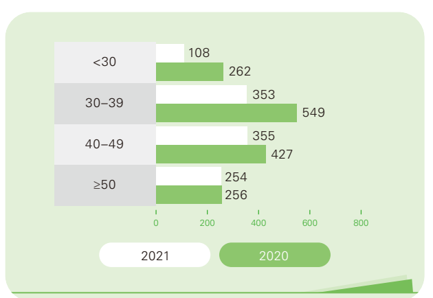
Staff by age