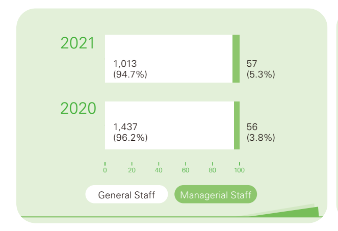
Staff by category